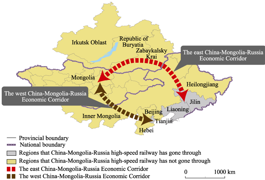
Figure 1 Map showing the research area and locations of the proposed economic corridors

Meanwhile, the high-speed railways for Beijing-Kalgan, track length 174 km, and Kalgan-Hohhot, track length 286.8 km, have been constructed, and completion and operation are expected in 2019 and 2018, respectively. The segment from Hohhot-Ulanqab has been finished and officially begun operating on August 3, 2017, with a length of 126 km. In addition, according to China's Medium- and Long-term Railway Network Plan , the Sui-fenhe-Manzhouli high-speed railway channel has been planned with a planned route of Sui-fenhe-Mudanjiang-Harbin-Qiqihar-Hailar-Manzhouli. Therefore, in the future, the east high-speed railway only needs to extend as Qiqihar-Manzhouli-Russia- Mongolia, and the west high-speed railway needs to extend as Beijing-Kalgan-Hohhot- Mongolia-Russia. Therefore, the research area for this study includes eight research units, Beijing, Hebei, Inner Mongolia, Heilongjiang, Mongolia, Zabaykalsky Krai, Republic of Buryatia, and Irkutsk Oblast, as shown in Figure 1.