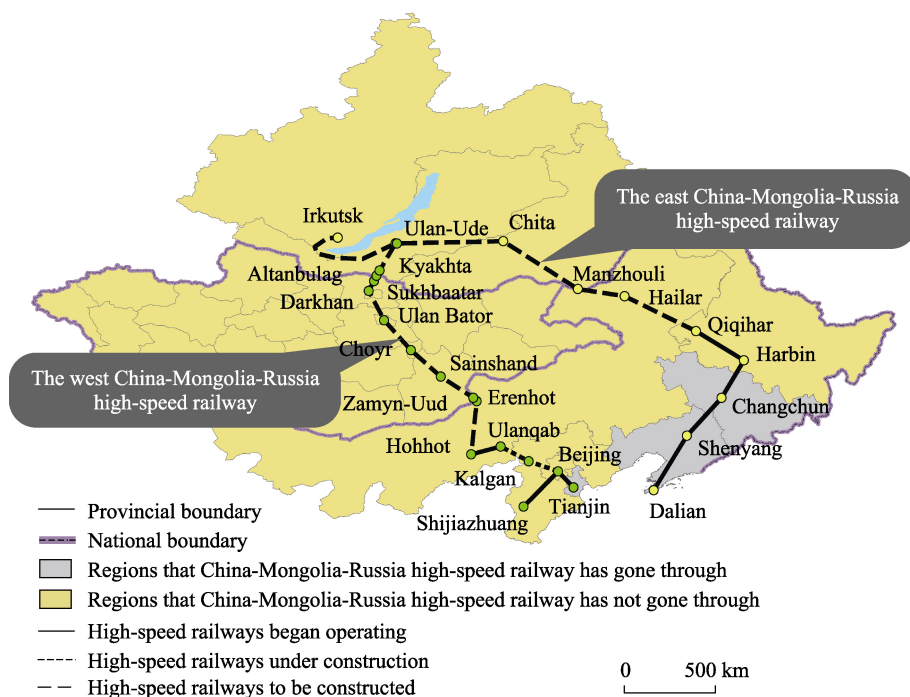
Figure 4 Map showing the proposed east and west China-Mongolia-Russia high-speed railway routes

The west China-Mongolia-Russia high-speed railway: Shijiazhuang/Tianjin-Beijing-Kalgan-Ulanqab-Hohhot-Erenhot-Zamyn-Uud-Sainshand-Choyr-Ulan Bator-Darkhan-Sukhbaatar-Kyakhta-Ulan-Ude.