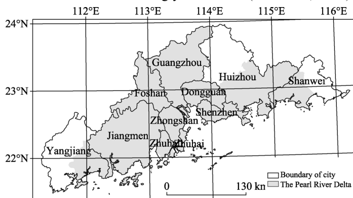
Figure 1 Location of the Pearl River Delta region

The Pearl River Delta is China's second largest river delta, located in the central and southern coasts of Guangdong Province. Based on the effective range of storm surge disasters, and contrary to the traditional economic and geographic definition of the Pearl River Delta region, we excluded Zhaoqing (which is located at a high elevation and is thus not affected by storm surges) from the study area, and added Yangjiang and Shanwei, near the Pearl River mouth. Thus, the study area in this paper included Guangzhou, Shenzhen, Zhuhai, Foshan, Jiangmen, Dongguan, Zhongshan, Huizhou, Yangjiang, and Shanwei covering an area of about 1.1 \times 10^4 \text{ km}^2 (Figure 1). With its broad plains, dense drainage system, long coastline, terrain and hydrological conditions, the study area is very suitable for agricultural development. Due to the good geographic location near Hong Kong and Macao and high level of urbanization, the region is one of the most important places in Guangdong in terms of rice and vegetables crops. However, with intensifying global warming and rapid economic development and urbanization, sea level rise, severe storm surges, and coastal erosion, the Pearl River Delta has become increasingly vulnerable (Han et al. , 2010).